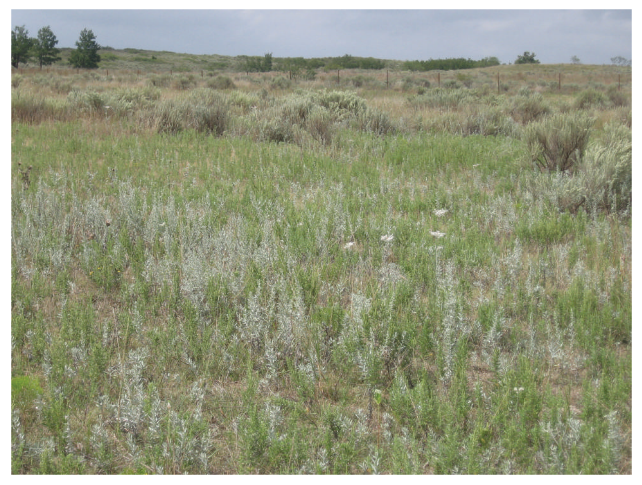
An example of a forb rich area in foreground surrounded by sand sagebrush nesting cover. The foreground is dominated by western ragweed, which is an important food plant for LPC and quail.

LPCs do not require free-standing water (41). Similar to other birds, water requirements are met by the consumption of succulent vegetation and insects. During periods of drought, water from stock ponds and prairie streams may be used but does not appear necessary for this species.