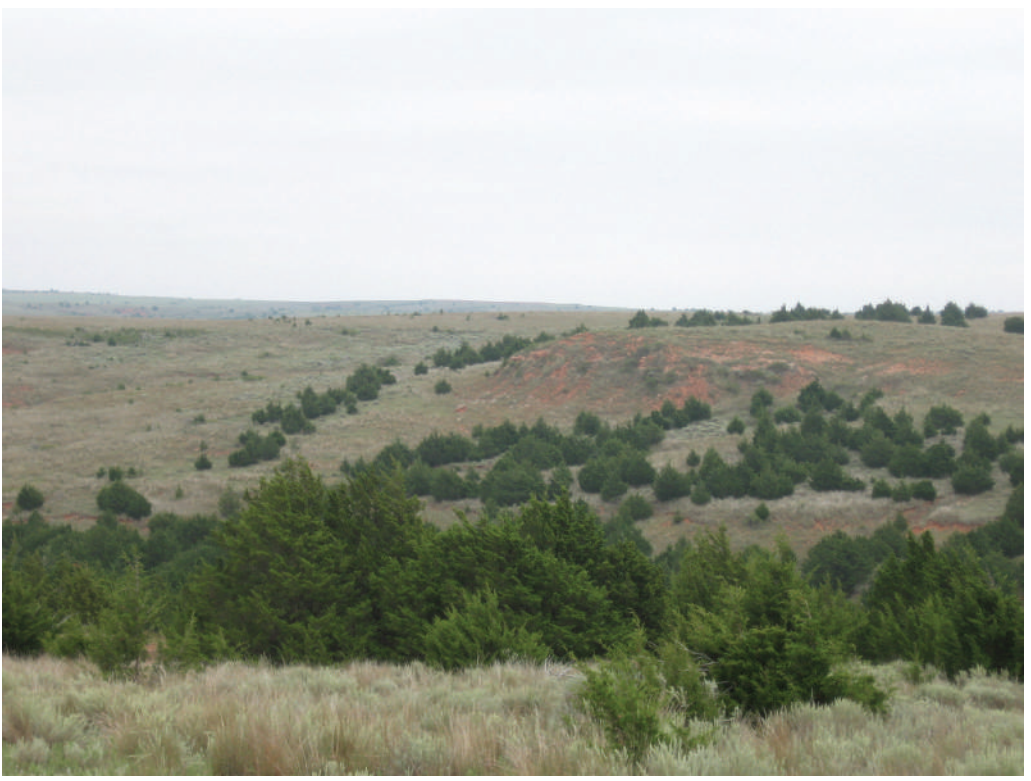
Eastern redcedar is expanding out of shallow soil areas into upland sites due to fire suppression. These upland sites could be occupied by LPCs if the redcedar were removed.