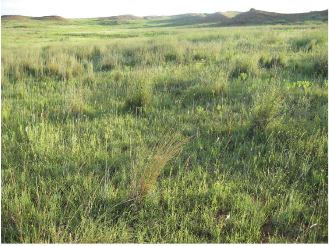
Large landscapes of native grasslands are the cornerstone of lesser prairie-chicken habitat.