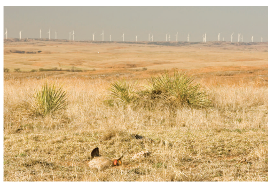
Lesser prairie-chickens struggle to survive with new threats on the horizon.