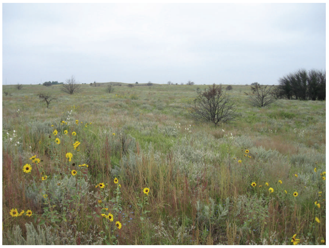
Vegetation response six months after a fire. Note the abundant forbs present and the redcedar skeletons.

to the LPC, while also maintaining high forage quality for livestock. Patch burning has been shown to increase plant and animal diversity without negatively affecting livestock production (12). By using fire in this patchwork pattern, cattle rotate themselves around the pasture following the recent fire. This reduces high cost, high input management. This system also allows stockpiling grass (grass banking) for dormant season grazing (reduces winter feed costs) or for LPC nesting, as well as providing additional forage during drought. Except for actually conducting the burn, no additional labor or structures are required over typical rotational grazing with fences. Additionally, existing cross fences can be removed, which will benefit the LPC by reducing fence collisions. Thus, this fire-grazing interaction has the potential to be beneficial to the LPC and other wildlife species.