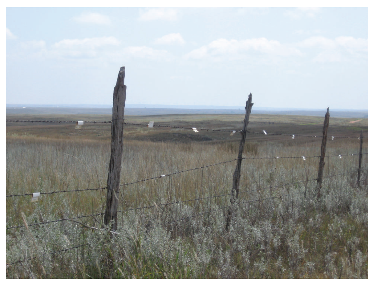
Fence collisions are a major source of mortality for lesser prairie-chickens. In areas where fences are needed, fence markers have been shown to greatly reduce collisions. Old fences no longer needed should be removed.

There are significant concerns related to habitat fragmentation effects associated with grassland birds' avoidance of vertical structures and human disturbance that wind turbine complexes create (27, 29, 30). The life cycles of prairie-chickens require vast areas of relatively unfragmented grassland habitat. Loss of native prairies has been estimated to be 80 percent (23). Thus, the effect of each additional fragmentation