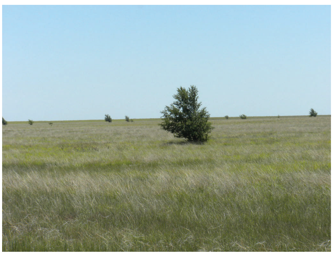
This CRP field has been invaded by eastern redcedar. Fire frequency or mechanical control is the key to prevent this problem.