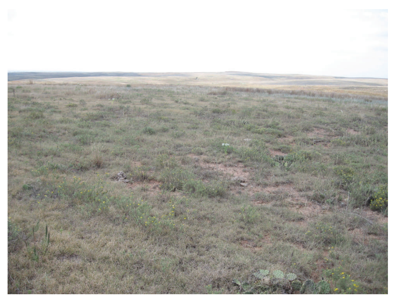
This lek site is on a high ridge that has low and sparse vegetation due to the shallow soil. It provides a good place for lesser prairie-chicken males to be seen and heard.

are not successful. LPCs select tall grass or shrub cover, if available, for nest sites. Thus, unburned and lightly grazed areas within two miles of leks are critical for reproduction (26). LPCs need native grasses that are at least 18 inches tall to completely conceal nesting hens and foraging chicks, as well as provide good thermal cover in winter and summer. Areas with high amounts of sagebrush canopy have been shown to be favored by nesting LPCs (27). Livestock grazing impacts prairie-chicken habitat by changing the amount, kind and pattern of residual grass. Uneven grazing patterns under season- and yearlong continuous grazing creates an interspersion of short grass; bare ground; and tall, lightly grazed bunches of grass assuming the livestock stocking rate is appropriate. This structural diversity provides easy travel lanes for broods, abundant access to seeds and insects, and escape cover. Patch burning and the resulting patch grazing will