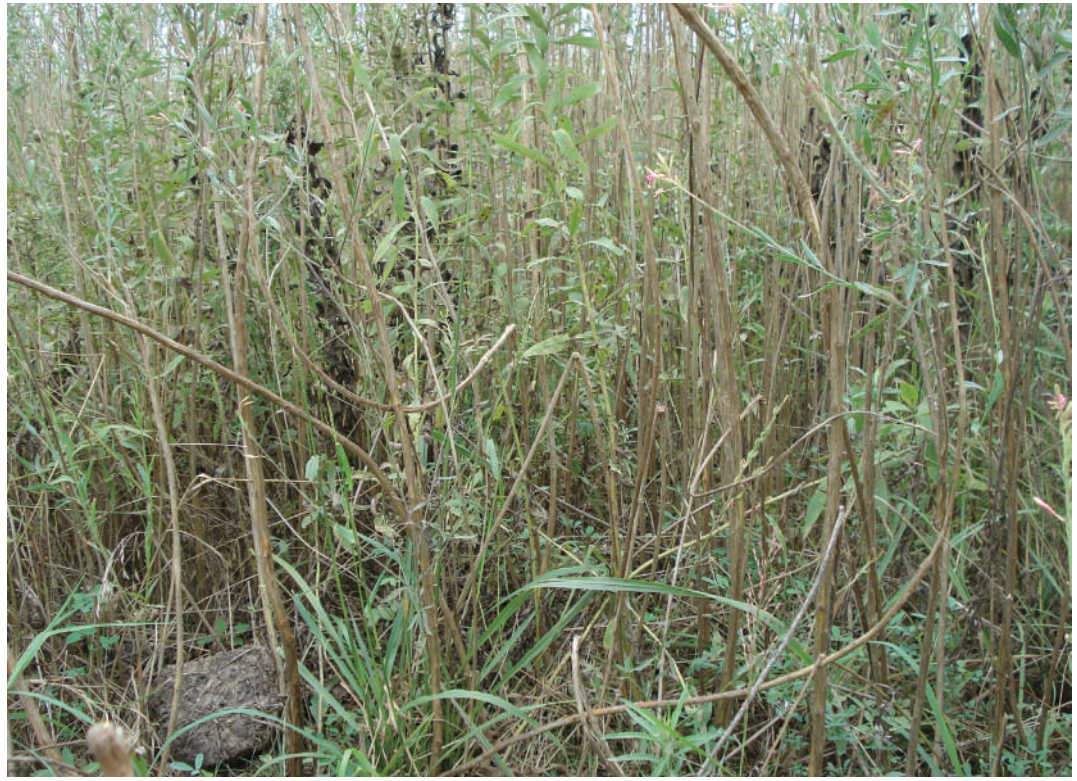
Forb dominated communities are typically open at ground level, which aids in chick movement and foraging, and provides escape cover.