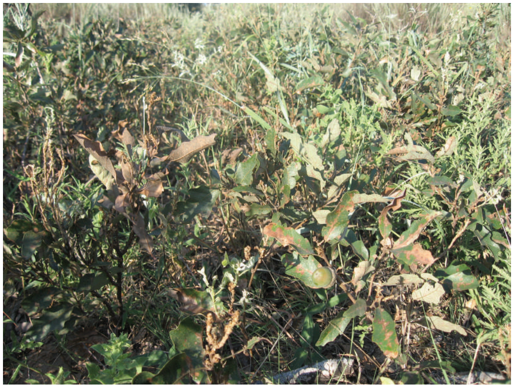
Shinnery oak provides cover and mast for lesser prairie-chickens in portions of their range including New Mexico, Texas, and Oklahoma. The structure of this plant is easily modified as this plant resprouts following fire.