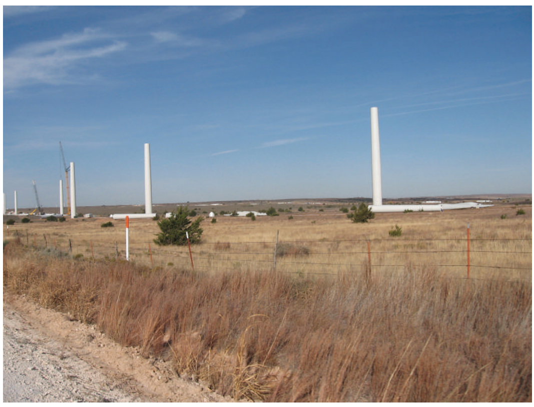
Fragmentation can come from many sources including wind turbines, roads, fences, trees, oil and gas wells, and power lines.