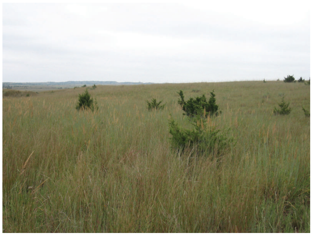
Young eastern redcedar is easily controlled with fire. However, within 7-10 years it becomes difficult to remove without expensive mechanical control or very intense fire.