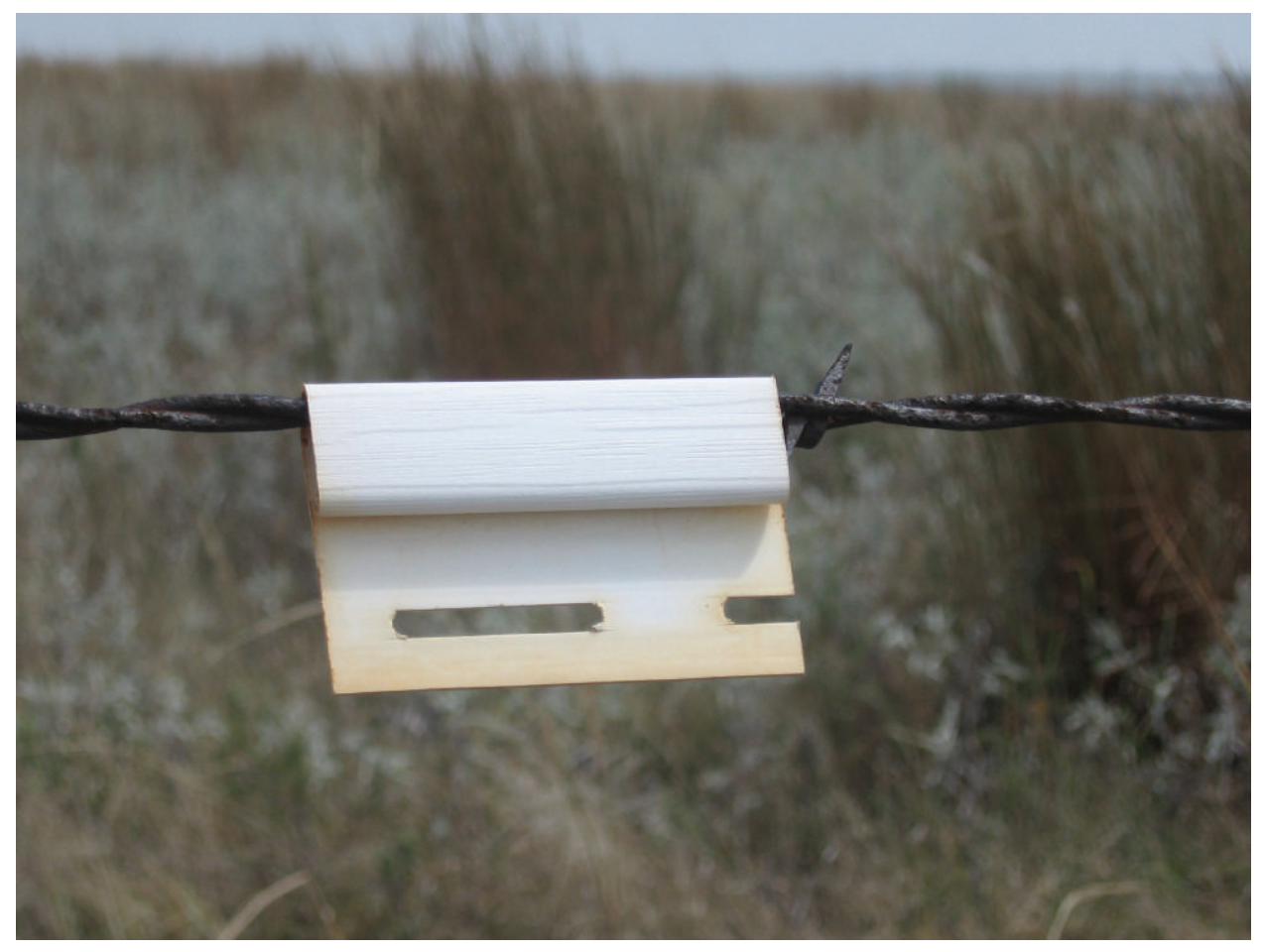
A vinyl fence marker used to help LPCs see fences during flight. Fence marking methodology is available at <u>www.suttoncenter.org/LPCH/fences</u> (44).

influence is magnified. Many other factors diminish existing unfragmented habitats including oil and gas production, road construction, housing development, crop production, excessive livestock grazing and woody plant invasion—this includes native woody plants that have been allowed to become too tall.