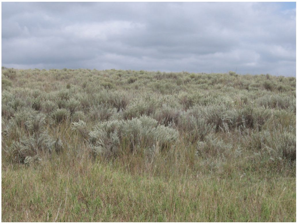
A sand sagebrush community that provides excellent lesser prairie-chicken habitat.