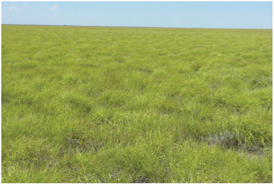
A CRP field in Oklahoma planted to Old World Bluestem. Note the lack of diversity in plant composition and structure. This field will need several applications of herbicide and be planted in a native grass and forb mix to become quality LPC habitat.