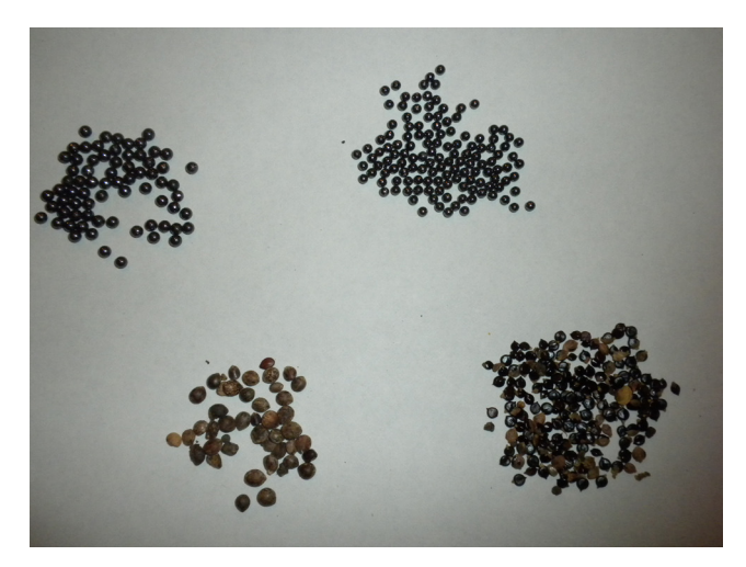
Figure 1. Popular shot sizes for bird hunting is similar in size to many preferred game bird foods. Clockwise from top left, #6 lead shot, #8 lead shot, wooly croton seed and Pennsylvania smartweed seed.

Upland game birds also are susceptible to lead poisoning. Lead impacts have been documented for virtually every species of upland game bird in the U.S., including ring-necked pheasant, northern bobwhite and wild turkey, but perhaps no other upland game bird is more at risk than the mourning dove. The primary reason for their susceptibility is the same as waterfowl's--concentrated hunting. Some dove fields collect more than 2.5 million pellets per acre each year. Since the ground is often bare or nearly so in prepared fields, lead is more available for ingestion. Also, the size shot commonly used for dove hunting is very similar to seeds consumed by the mourning dove (Figure 1). Doves have difficulty maintaining their core body temperature after ingesting lead and appear to die rapidly. As few as two pellets can kill a mourning dove, but doves often consume multiple pellets (Figure 2). There is little known about the impacts of lead on passerine bird spe-